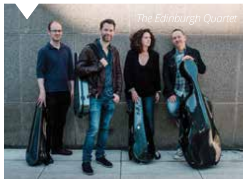
The Edinburgh Quartet