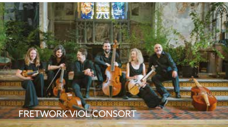
FRETWORK VIOL CONSORT