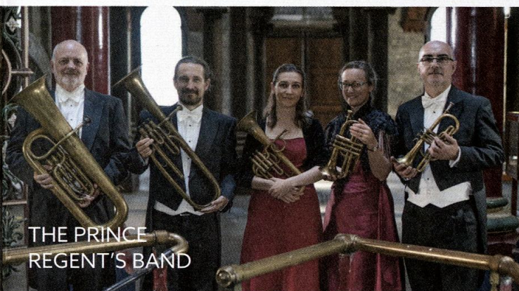
THE PRINCE REGENT'S BAND